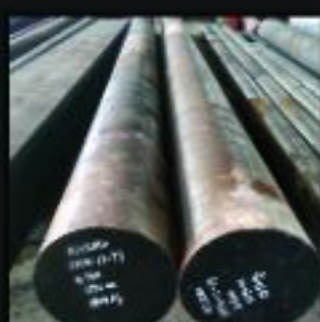
Forged Steel Round